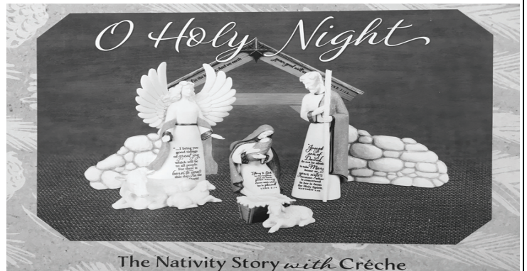
The Nativity Story with Crèche

Please pray for the newly wed in Christ.